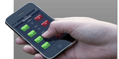
i-Port for Smartphone