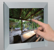
Picture Touch Panel