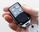
2 or 4 zone keyfob